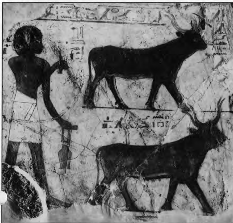
Fragment of wall painting from Theban tomb no. 54, Huy, Thebes (OIM 11047)

good three and a half hours commuting from Luxor daily. We were a small team, seven altogether, and so could stay in a couple of the six small houses or villas built to accommodate the engineers at the old British gold mining camp. The villas are solidly constructed (if short on window glass), each with a common room or dining room, a kitchen of sorts, a cement-slab type of bathroom, and two or more bedrooms. House number two had the only functioning kitchen, plus a broad hallway that served as auxiliary lab space. Water piped in from the wells at Bir Umm Fawakhir was probably pretty good, the continued on page 2