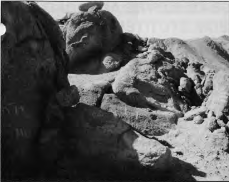
Guard post overlooking main site, showing sheltered areas and graffiti

would expect some protection for the gold and its transport to the Nile, if not for the workmen, their families, animals, and homes. Although the steep walls of the wadi might constitute some protection, no formal defensive structures have yet been found. The guard post high on a granite knob is little more than a couple of sheltered nooks plus a few very sketchy Greek graffiti, but it does command a fine view of most of the main settlement, some of the outlying clusters of ruins, and all three roads approaching the wells.