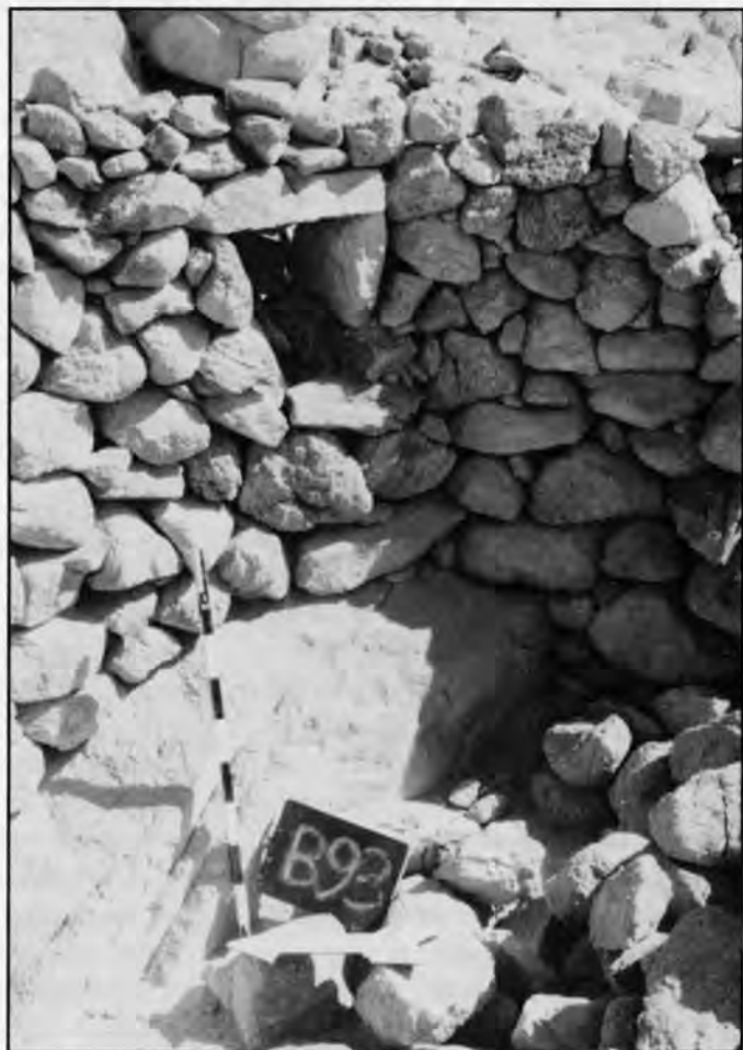
Building 93, back wall with niche, built against a cliff

The next to last working day Steve found a guard post. If, as we believe, the major product of ancient Bir Umm Fawakhir was gold, we