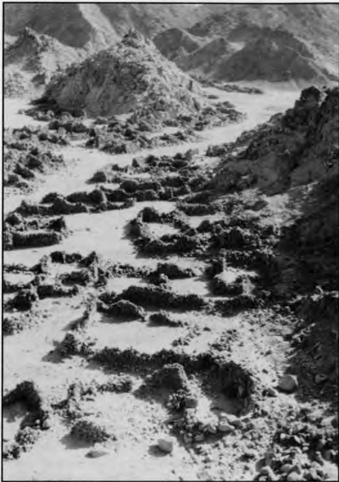
Building 70 in foreground, looking to the east

areas a few days later, and they are actually quite easy to miss. High on the ridges overlooking the main site, the graves are usually no more than natural clefts in the granite with rough stone cairns piled over. All burials spotted so far have been looted, though there were significant sherd scatters in the vicinity.