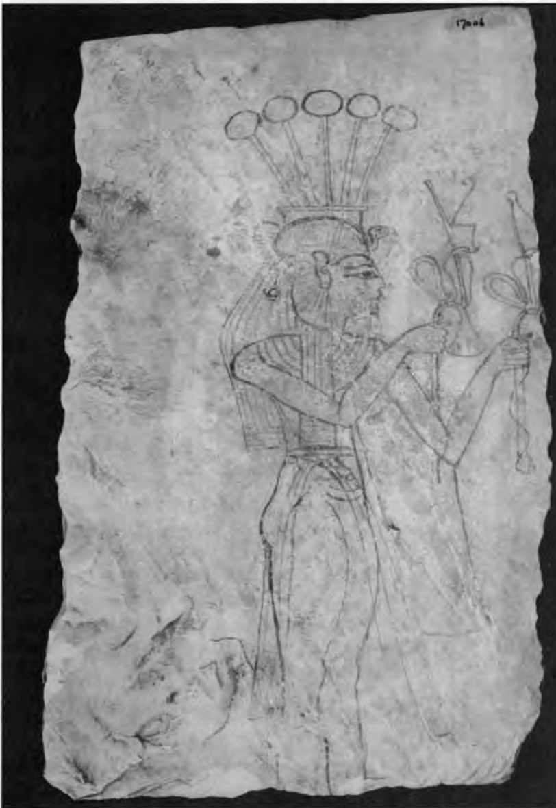
Figured ostracon bearing a drawing of a Ramesside Queen (OIM 17006)